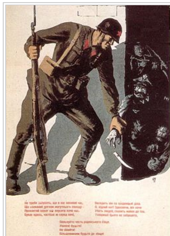
A Soviet propaganda poster urging the civilians to beware of spies; in this case a man in the shadows wearing Polish officers parade uniform.

According to a report from 19 November 1939, the NKVD had about 40,000 Polish POWs: about 8,000-8,500 officers and warrant officers, 6,000-6,500 police officers and 25,000 soldiers and NCOs who were still being held as POWs. [13][16][22][23] In December, a wave of arrests took into custody some Polish officers who were not yet imprisoned, Ivan Serov reported to Lavrentiy Beria