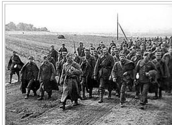
Polish prisoners of war captured by the Red Army during the Soviet invasion of Poland

Poland and the Soviet Union never officially declared war on each other; the Soviets effectively broke off diplomatic relations when they withdrew recognition of the Polish government at the start of the invasion. [17] The Soviets chose to regard captured Polish military personnel not as prisoners