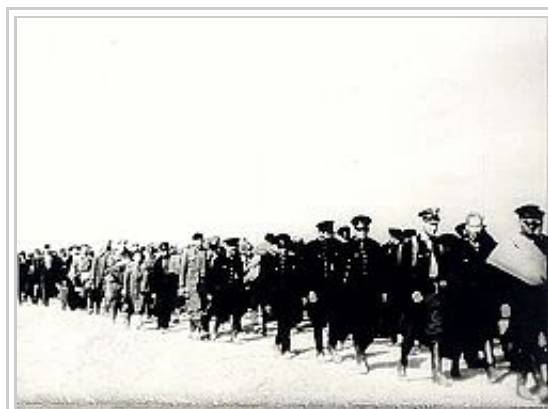
Polish policemen and civilians captured by the Red Army after the Soviet invasion of Poland